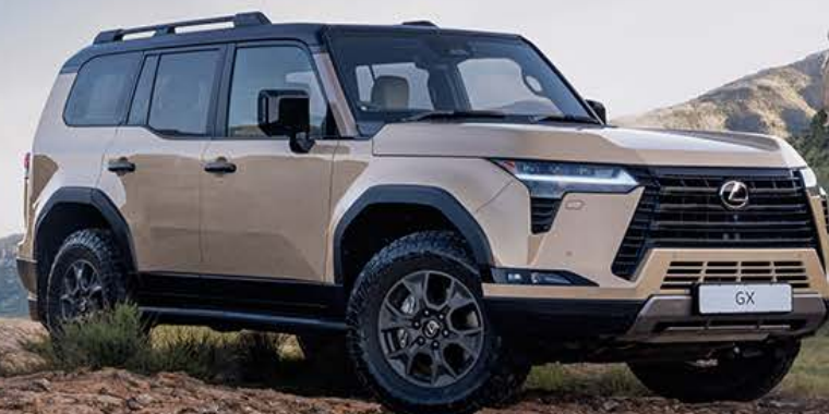
▼ GX 550 OVERTRAIL

The GX 550 SE is the premium petrol SUV that's rooted in luxury. This seven-seater cruiser houses a 3.5-litre twin-turbocharged V6 engine, producing 260kW of power and 650 newton metres of torque. It comes in monotone colours to make an exterior statement, while its 21-speaker Mark Levinson® Audio System ensures an immersive sound experience on the inside. Thanks to a Double Wishbone Suspension and a Rear Differential Lock, navigating rocky trails and sandy dunes is as smooth as a casual drive in the city. Not to mention the convenient Kick Sensor for easy access to the boot, a refreshment-ready fridge console box, as well as the Panoramic Roof to let the rays in on those sunny road trips.