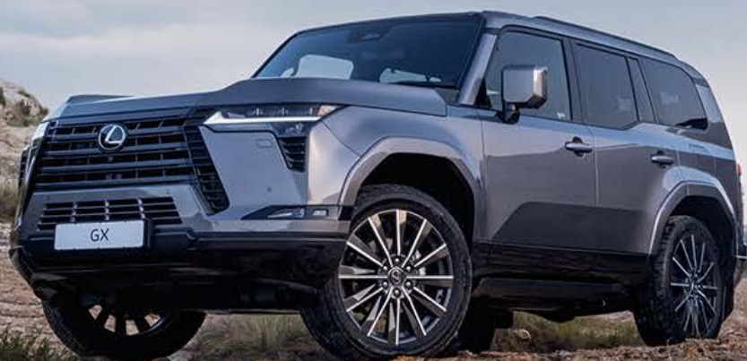
▼ GX 550 SE